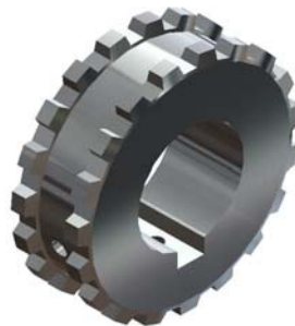
Stainless steel dual tooth drive sprocket